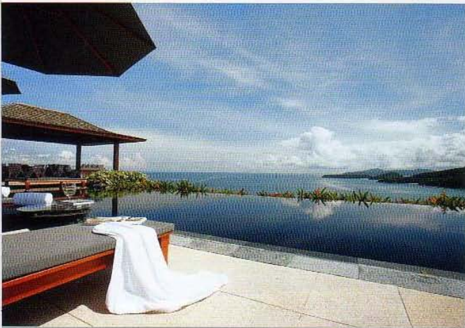
Andara's oceanscape of the Andaman Sea

Private residences and independent resorts pepper Phuket island with travel destinations for all tastes, reports Paul Hicks