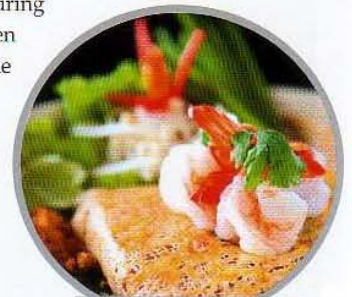
Dinner at Talung's

but the chances are you won't be wanting to go out too much. One reason is the great dining as you overlook the ocean crashing on the rocks below at either Talung Thai or Diavolo, the signature Italian restaurant. Or for a very special signature dining experience, sit in one of the private "islands" of the fibre optic lit infinity pool where the light patterns mimic the night sky above.