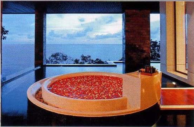
The Dima Suite at Paresa